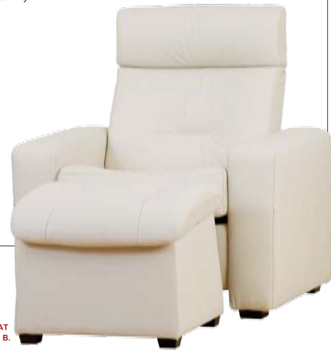
FS 340 1 SEAT WITH ARM B.